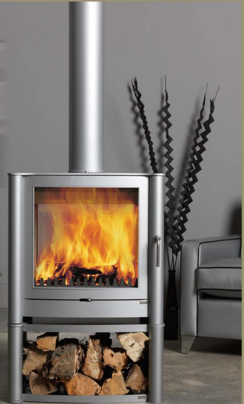
FB2 Double sided with logbox

The FB2 is also available as a double sided stove, dimensions and output are identical to the standard FB2 but you get twice the view. The logbox and multi-fuel kit are also available for the double sided stoves. Note, the stove door can only be opened on one side.